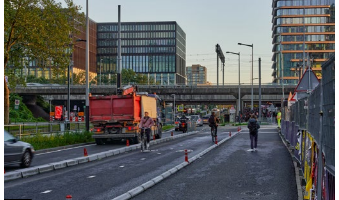
▶ From 29 April All cyclists and pedestrians to use the cycle/foot-path on the western side.