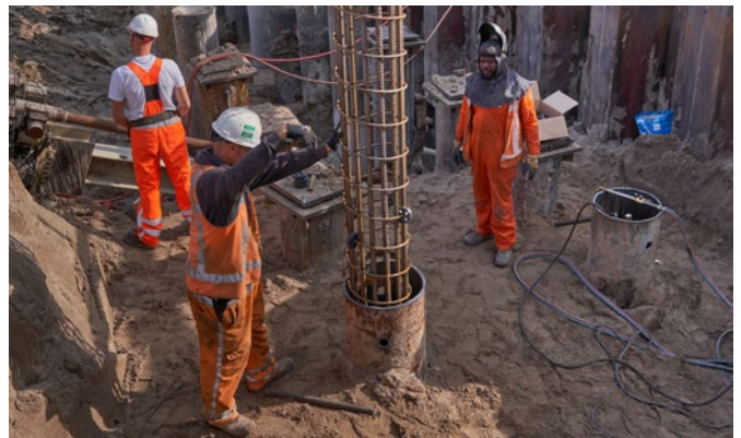
▶ 30 May - 1 June Overnight building works to insert reinforcement cages.