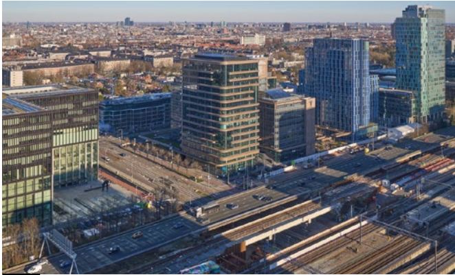
▶ 3 - 5 April Overnight building works to reroute the Parnassusweg.