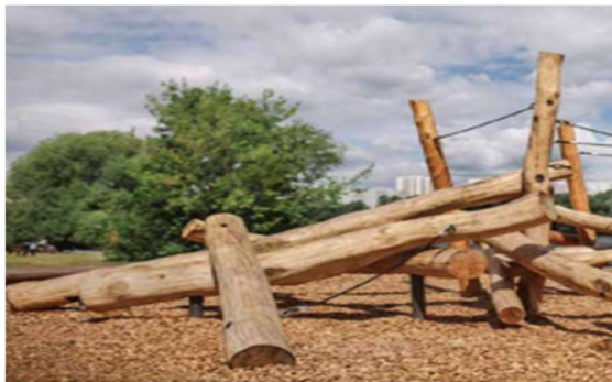
Example of wooden play equipment