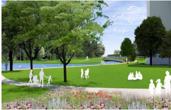
Impression of the 'open basin'

like the vegetation on and around the buildings. The embankments will be designed in a wildlife-friendly fashion, with environmentally compatible vegetation. The emphasis will be on green, serenity and relaxation.