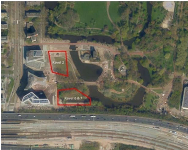
Plot 2 (Habitat Royale) and plot 6/7 (Park Meadows) near Beatrixpark

The Zuidas district Beethoven, which is located in between Beethovenstraat, Prinses Irenestraat, Beatrixpark and the A10, is currently buzzing with building activity, related to the construction of the Park Meadows complex on plot 6/7 (see map below). In addition, the building formerly known as Convict is being prepared as a shelter for Ukrainian refugees, and behind the scenes, the design for Habitat Royale, the planned residential building on plot 2, is being finalised. In this newsletter, we would like to inform you about the latest developments and present the preliminary design for the public space in this area.