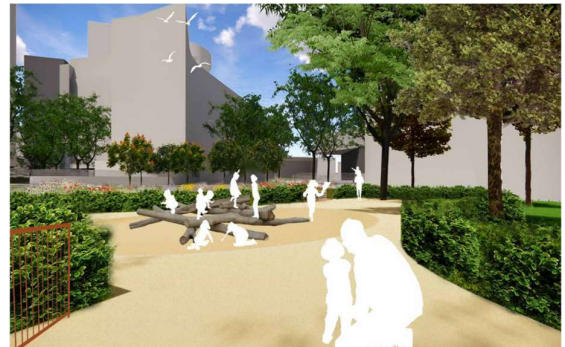
Impression of the play area