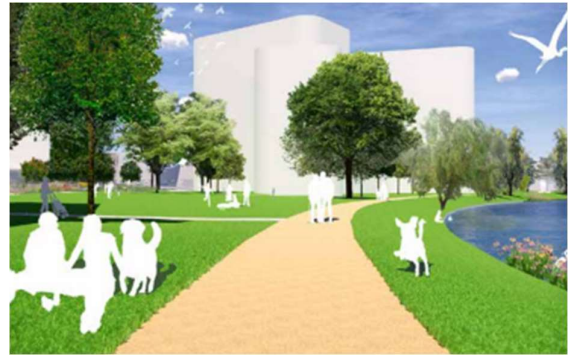
Impression of the footpath along the embankment