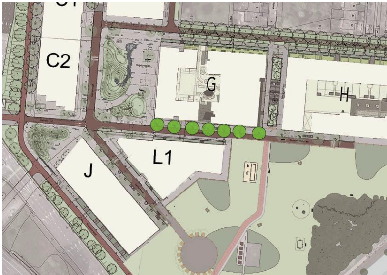
Figure 2; Location of trees on Gaasterlandstraat